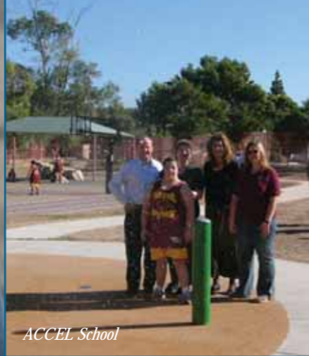
Arizona Childrens Association