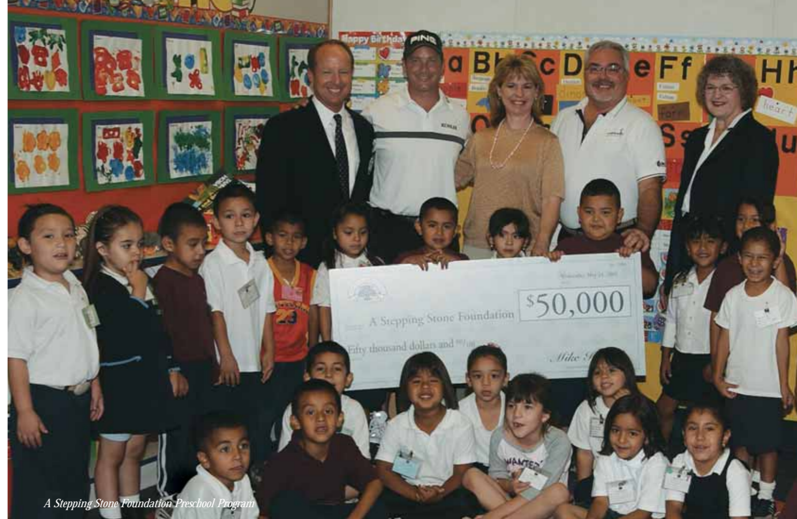
A Stepping Stone Foundation Preschool Program