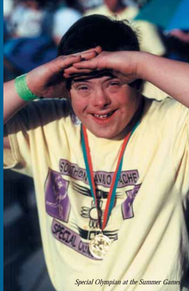
Special Olympian at the Summer Games