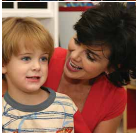
fbr open and thunderbirds raise a record $6.8 million for arizona charities in 2006