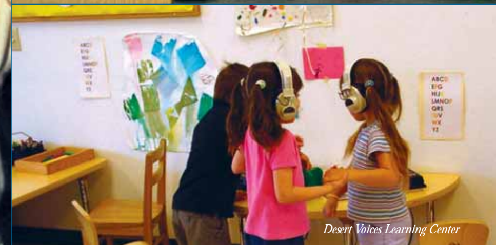
Desert Voices Learning Center